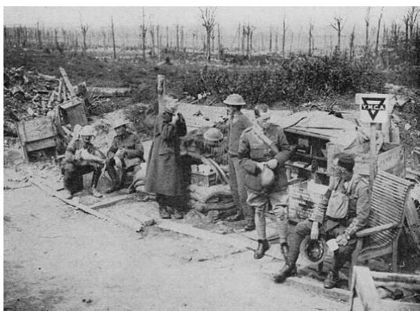
A road side canteen provided by the YMCA, near Wytschaete on 11 August 1917.

On 30 June 1915, YMCA received permission to establish a centre within the area of army operations. It opened a centre at Aire, then the location of HQ of First Army. By the end of the year, small centres were in hundreds of places close to the front. As the pictures on this page show, some of these were very close to the firing line, providing a welcome refuge.