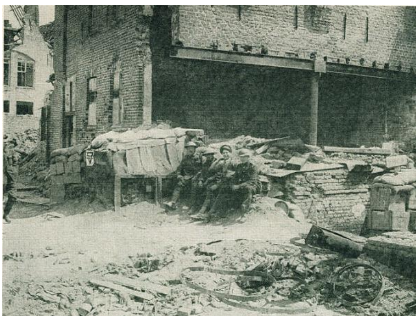
Another YMCA canteen, this time a "dug out" under ruined buildings in the shattered town of Ypres in June 1917.

June 1915 saw the YMCA open a hostel in France for the use of relatives, visiting dangerously ill men. A YMCA car met the visitors at the port and took them to see their soldier relative. There were in the region of 100-150 such visitors each day.